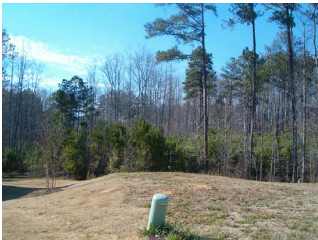
Current view from cul-de-sac

Note: picture is dated and does not reflect the current condition of pond. It is a representation of location and size.